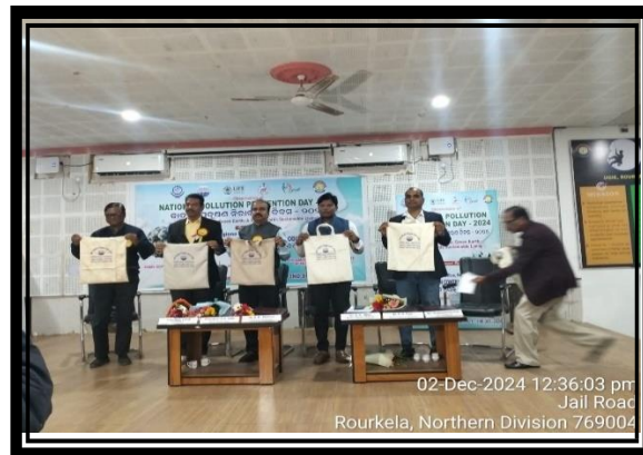
National Pollution Prevention day celebrated on 02/12/2024