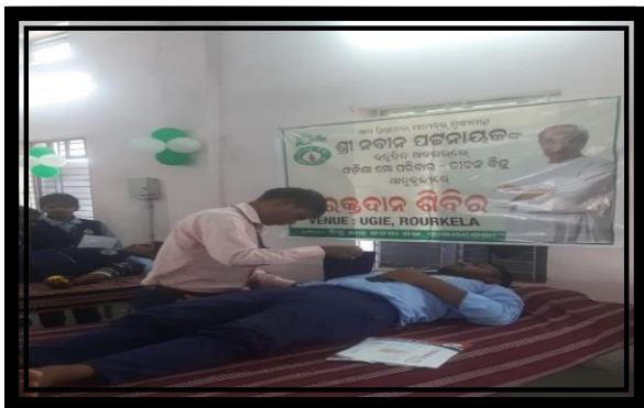
Blood donation camp on the eve of 62 years of UGIE