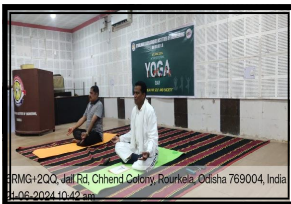
International Yoga Day celebrated on June 21 st , 2024