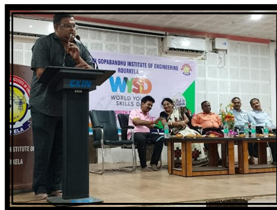
World Youth Skill Day celebrated on 15/07/2024

Moreover, other events like International Day of Peace on 21/09/2024, Udaymita Divas/Entrepreneurship Day was celebrated on 31/08/2024 etc.