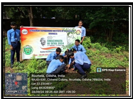
Plantation drive and Swachhata divas celebrated on 28/09/2024

Moreover, other events like International Day of Peace on 21/09/2024, Udaymita Divas/Entrepreneurship Day was celebrated on 31/08/2024 etc.