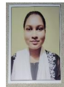
2 nd sem Taslima Nasreen